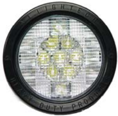
019-01-500 White 4" round interior dome light 12/24V