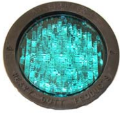
019-01-481 Green 4" accessory light grommet / harness kit 12/24V